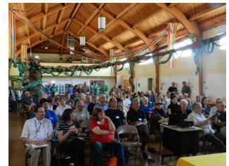
2017 Annual Meeting